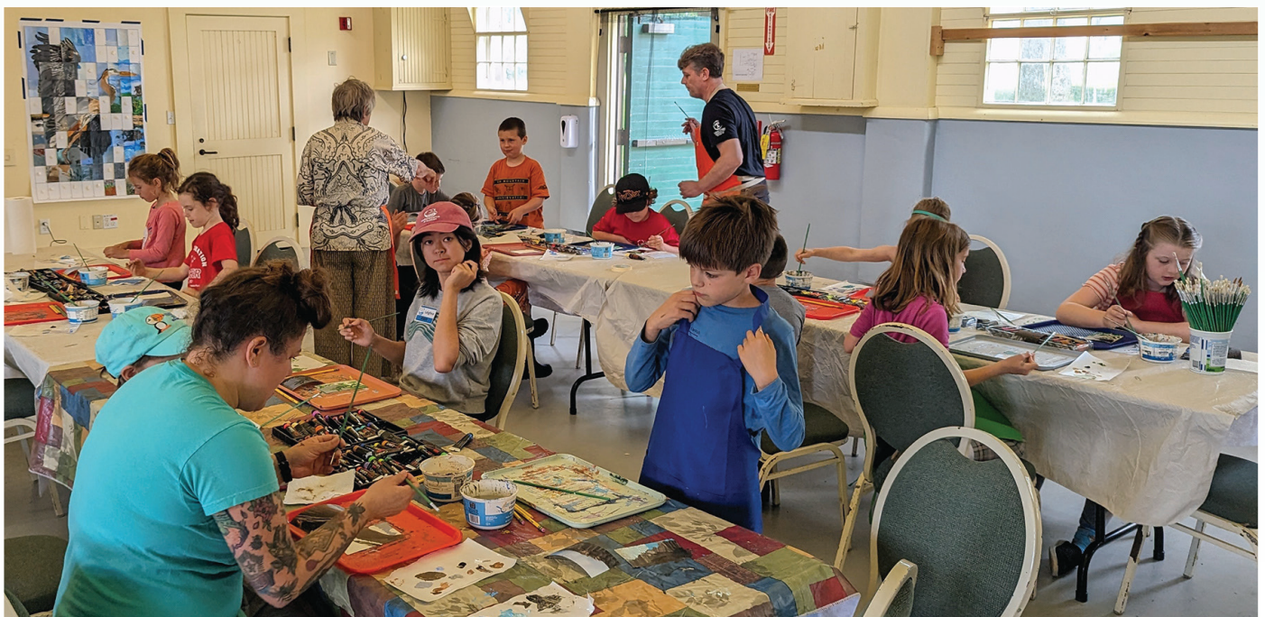
KIDS AND THEIR LEADERS IN THE FEATHERED FRIENDS DAY CAMP APPLY THEIR PERSONAL TOUCHES TO HERON.